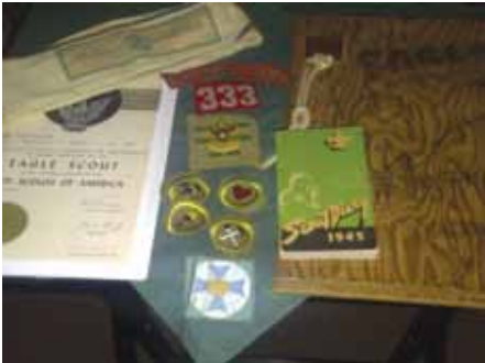
Among items donated by former Troop 333 Scouts are a cap, patches, hand-carved Eagle Patrol log book, Scout diary, Eagle Scout certificate and handmade neckerchief.