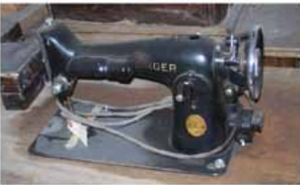
Vintage Singer sewing machine donated by a former internee.