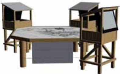
Features include a scale model of the camp.