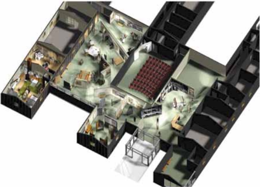
Overview of the ILC shows the various exhibit areas, replicated barracks and multipurpose theater, and reflection room.