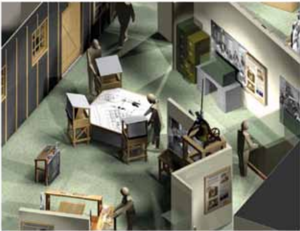
Main exhibit room combines artifacts with modern technology.

When visitors tour the Interpretive Learning Center at the Grand Opening on August 20, they will encounter a permanent exhibit that draws them into the drama of life behind the barbed wire fences of the Heart Mountain Relocation Center.