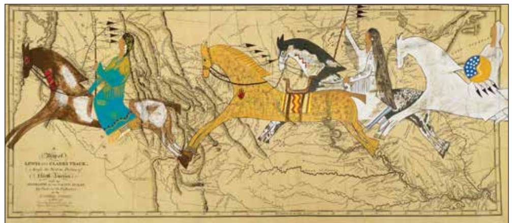
"Spirit Rider" was one of the works on display at the Interpretive Center.