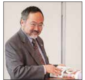
Keynote Speaker Judge Ito

There is still time to register for this year's event which will celebrate the pending acquisition of the Heart Mountain Root Cellar, the restoration of the Hospital Chimney and the dedication of the new James Ito Historic Garden! Weekend packages are only $75 and include the Friday evening Pilgrimage Dinner with Keynote Speaker Judge Lance Ito and activities at the Heart Mountain Interpretive Center on Saturday with opening remarks by Former Secretary of Transportation, Norman Mineta.