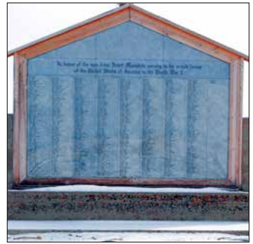
The Honor Roll Memorial commemorates by name the men and women from Heart Mountain who served in World War II.