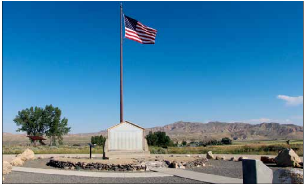
The Honor Roll Memorial rests on a bluff above the Heart Mountain Interpretive Center, surrounded by interpretive signs and the Setsuko Saito Higuchi Memorial Walking Tour.

The Honor Roll was built by Heart Mountain internees near the main gate of the camp in August 1944. They hand-painted the names of the servicemen and women from Heart Mountain onto grey asbestos panels, mounted onto a wood frame bulletin board. They collected stones from the nearby Shoshone River to build a circular wall and steps to define a base, where they erected a wooden flagpole. Today, upon close observation of the stone wall, one can trace handprints in the