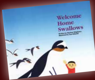
Welcome Home Swallows Book $14.95