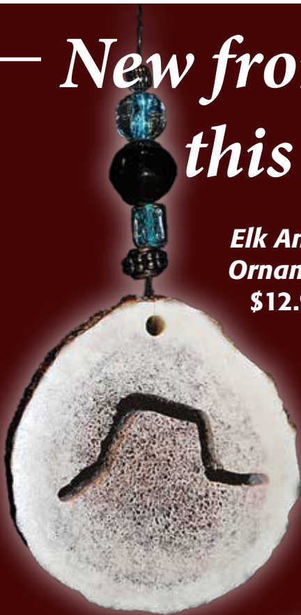
Elk Antler Ornament $12.95