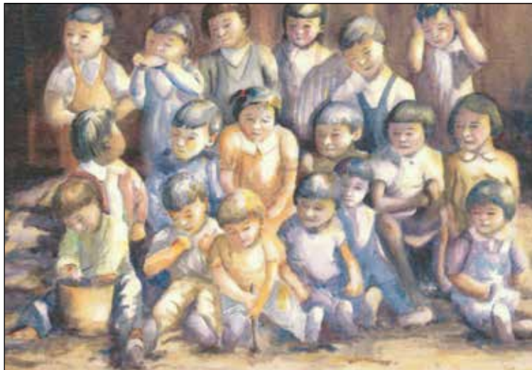
Executive Order 9066, Series 24: "Non-Alien" Nursery School, 1942-1945 Watercolor on Paper 30" x 22"

The children born at the Heart Mountain Relocation Center were very special. They were born American citizens in a place where they were incarcerated for looking like the enemy. All people of Japanese descent including Japanese Americans who lived on the West Coast of the United States were rounded up and detained in "Relocation Centers" until the end of World War II. This exhibit features photos and artifacts from just a few of the 558 babies born at Heart Mountain. Most photos contained within the exhibit are from the Heart Mountain Wyoming Foundation's Okumoto Collection with artifacts on display from the Heart Mountain Archives, the Park County Homesteader Museum and from HMWF staff.