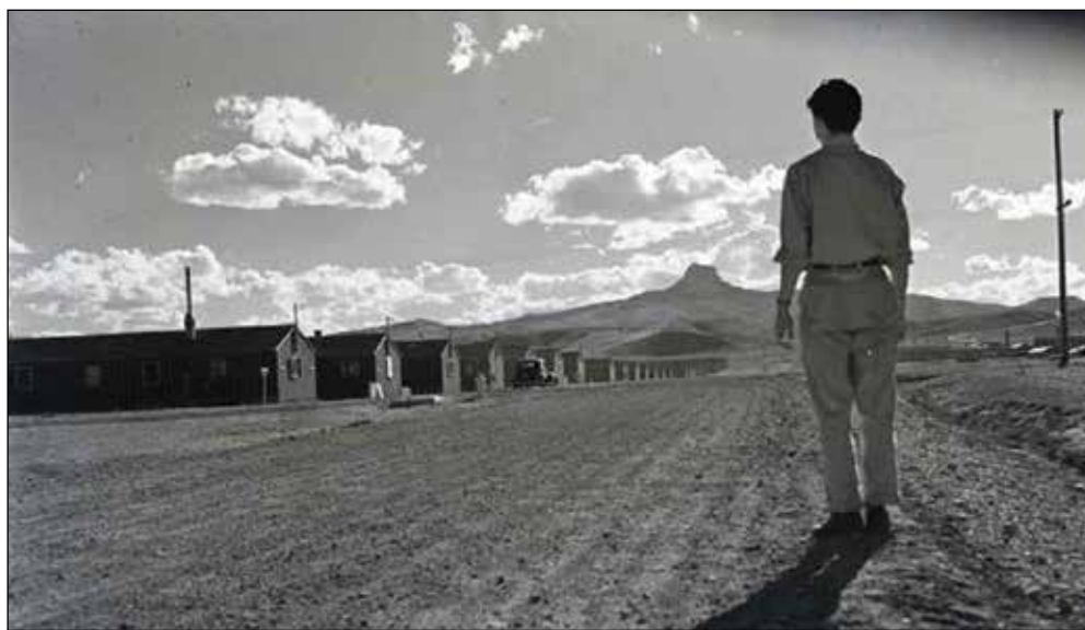
Scene from The Legacy of Heart Mountain .