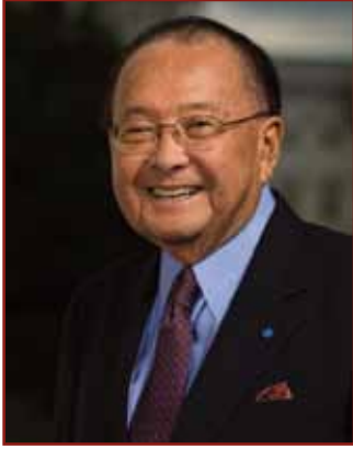
United States Senator Daniel Inouye

On Saturday, August 20, 2011 at 10 am, the Heart Mountain Wyoming Foundation will welcome an anticipated gathering of nearly 1,000 guests to celebrate the historical opening of the Interpretive Learning Center. To commemorate the occasion, the keynote address will be delivered by U.S. Senator Daniel Inouye. As president pro tempore of the Senate, Dan Inouye is third in line of succession to the presidency and the highest ranking Asian American elected official in our nation's history. From the Pacific Islands state of Hawaii, Sen. Inouye is not only one of our distinguished leaders in Washington but also one of the most decorated veterans of WWII. He served with the 442nd Regimental Combat Team and later earned the nation's highest award for military valor, the Medal of Honor.