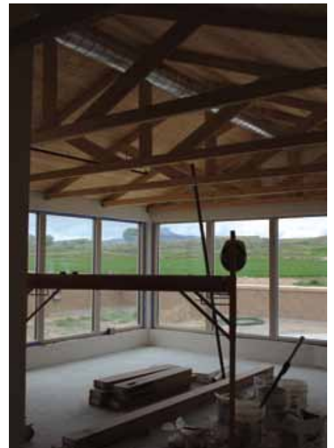
ILC construction, Summer 2011